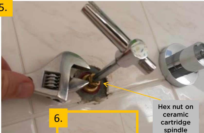
Hex nut on ceramic cartridge spindle

5. Assemble on the hot and cold lever handles only and turn to the off position for both. If water still comes from spout or shower outlet then tighten a little more. A small amount of water may be coming from around the cartridge in the wall or basin, this is okay as when you install the fibre washer and locknut this will stop the leak.